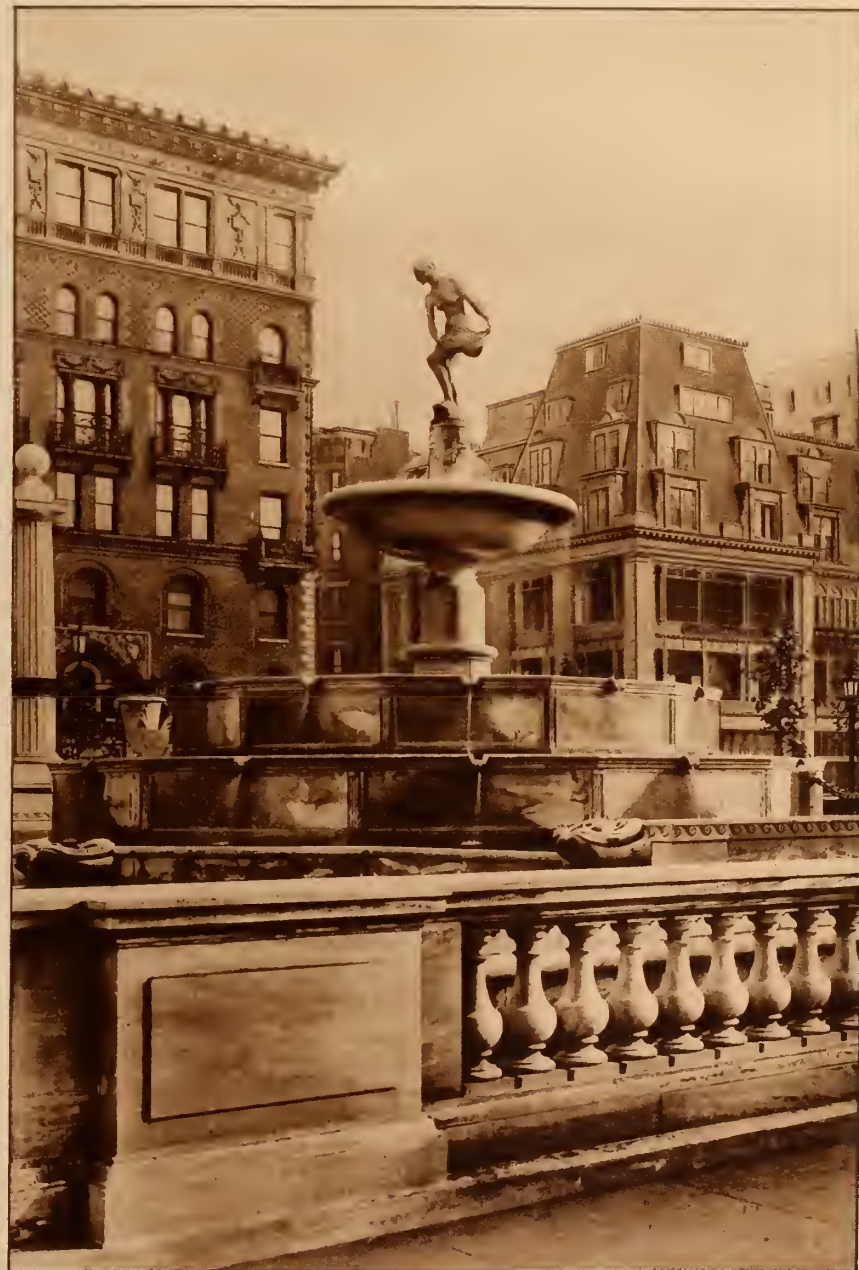
PULITZER FOUNTAIN. This fountain, situated near the entrance to Central Park at 59th Street, was given to the city by the late Joseph Pulitzer.